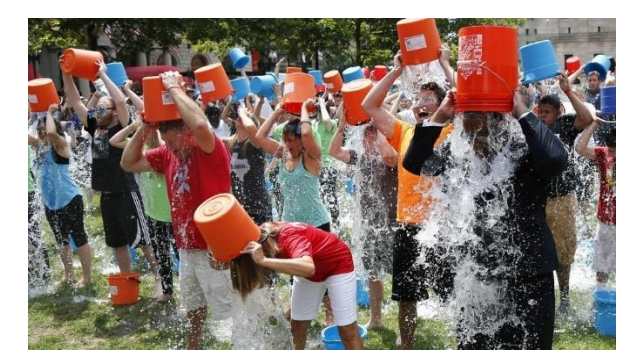
Figure 5: A group of people participate in the ALS Ice Bucket Challenge during the summer of 2014 (Olenski).

and less conducive to people dumping buckets of ice water on themselves. Conducting the challenge during the hottest months of the year encouraged participation because the challenge had a low barrier to entry and offered relief from local heat waves.