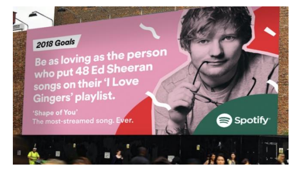
Figure 1: A billboard from Spotify's 2017 Wrapped Campaign featuring Ed Sheeran on a colorful background (O'Bien).

streamed the 'Boozy Brunch' playlist on a Wednesday this year" on separate regional billboards (O'Brien). The two-pronged approach of creating user-facing content such as the personalized year-in-review playlists and humorous billboards encouraged individuals to respond to Spotify on social media by organically posting pictures of the billboards or sharing