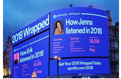
Figure 2: Billboard in London featuring local user's data promoting Spotify Wrapped ("Relive Your Year", Spotify.com)

unsuccessful attempts at data driven advertising like Netflix's unintentional shaming of a user who watched The Christmas Prince on repeat (Barrett). To preserve user privacy, Spotify continued to limit their publishing to non-personally identifiable data while also providing a path for people who wanted to publicly share their Wrapped results. Spotify